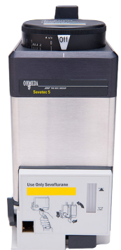
TEC 5 SEVOFLURANE KEY FILL VAPORIZER