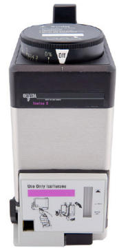
TEC 5 ISOFLURANE KEY FILL VAPORIZER