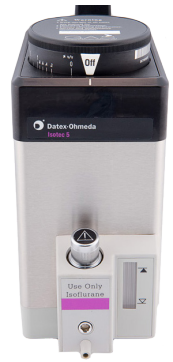
TEC 5 ISOFLURANE FUNNEL FILL VAPORIZER